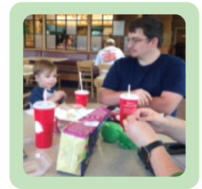
This family wanted their child to work on eating and asking for "more."

Services happen in a natural environment during the real-life activities that are important to a family. Some of these might be mealtime, during a favorite game, nap time routine, or playing at a playground.